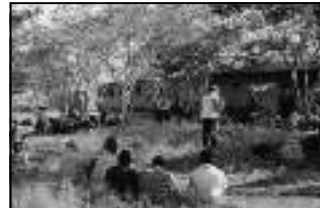
Village Feedback Meeting

We support vulnerable people by facilitating a process that gives them an effective voice, “the Right to a Say”, which enables them to work towards -