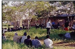
Village Feedback Meeting

We support vulnerable people by facilitating a process that gives them an effective voice, “the Right to a Say”, which enables them to work towards -