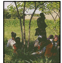
Women Have Their Say